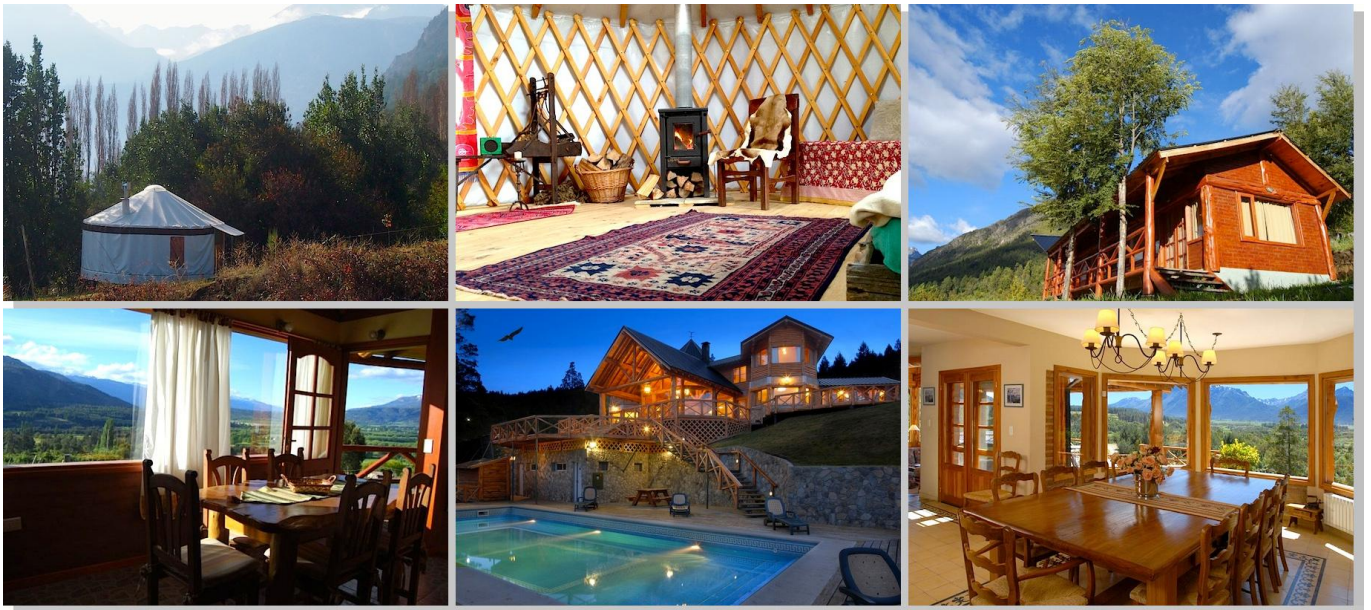
Jurte - Jurte inside - Cabin „El Capricho“ / „El Capricho“ inside - Luxury Resort „Villa Escondida“ - „Villa Escondida“ inside