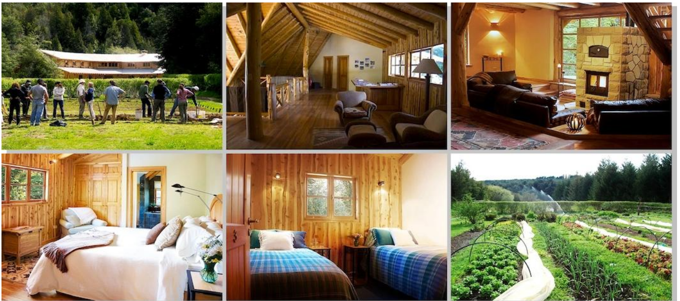
Gardening Seminar in „La Confluencia“ - Reading Corner - Lounge / Double Bed Room - Two Bed Room - Horticulture