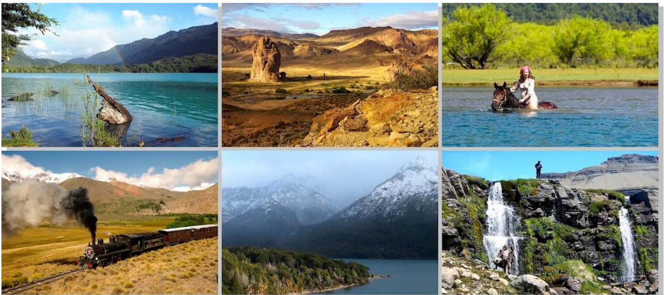
Lago Esperanza - Piedra Parada - Riding fun in the Lago Puelo / La Trochita - Lago Rivadavia - Cascades on Cerro Plataforma