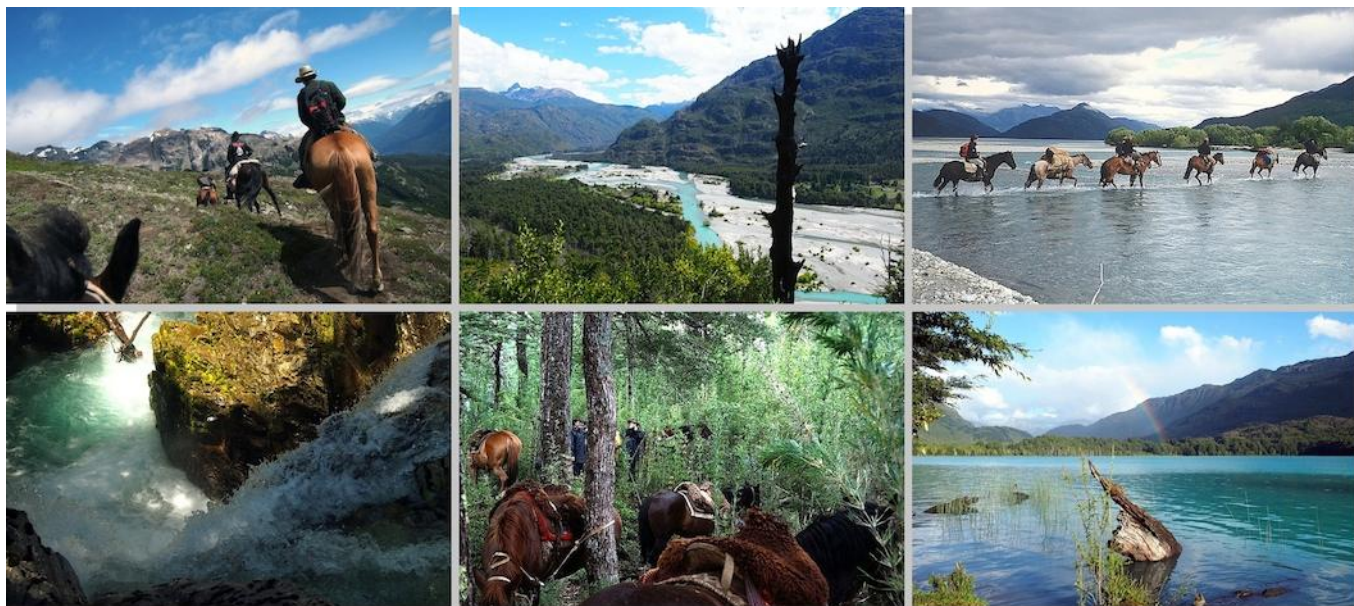
Pass Summit- Valley of the Rio Turbio - Crossing El Turbio / Cascada Juana - Patagonian Forest (Selva Valdiviana) - Lago Esperanza

The Horse trekking is the reduced version (or first stage) of our 10-day standard tour. The exact itinerary you find in the detailed description in the last section of this presentation.