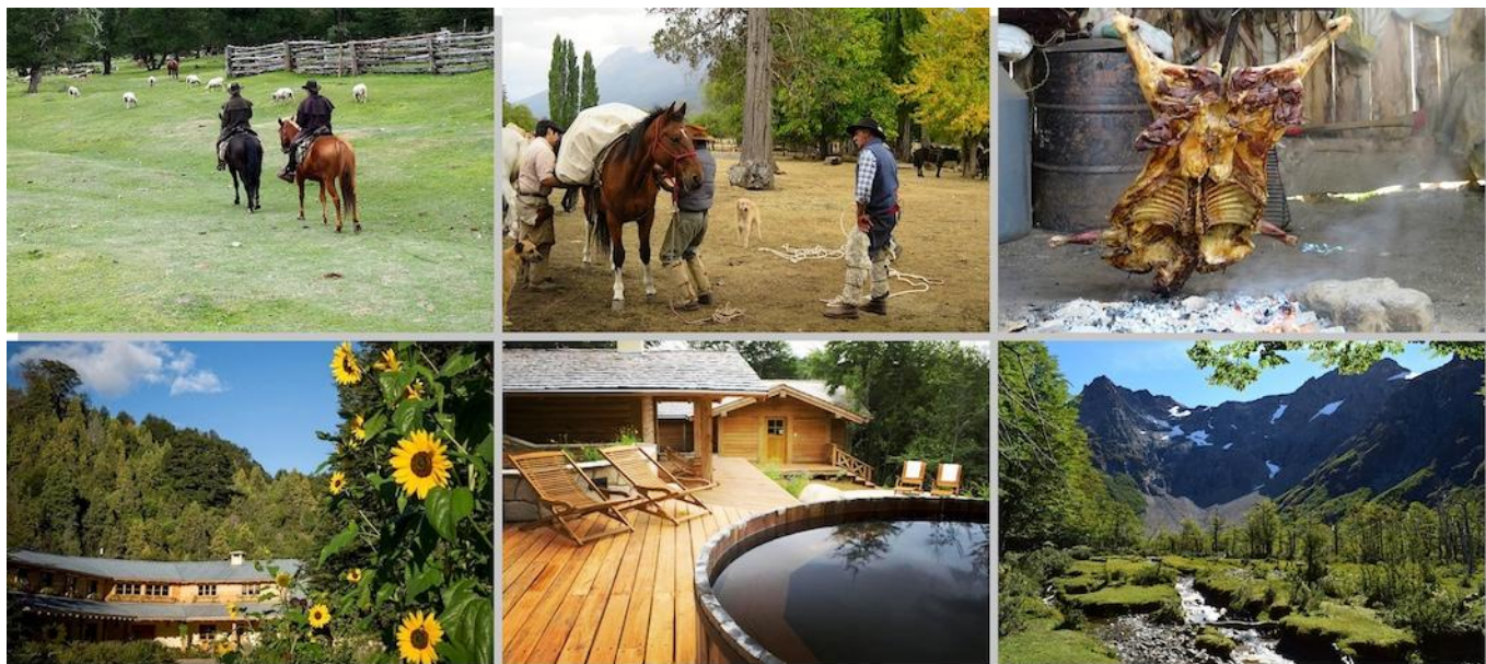
Campo Fernandez - Tata, Elvio and Cholo - Lamb Barbecue / La Confluencia - Hot Tube - Trekking destination „Hielo Azul“

>> more pictures of the Eco-Lodge „La Confluencia“