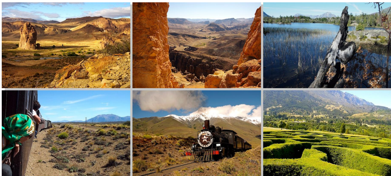
Piedra Parada- Piedra Parada Canyon – Laguna Alerce / Trip with th Trochita – La Trochita – El Laberinto in Rincón de Lobos

Several lakes and mountain lagoons motivate you for bathing fun or a day ride. Traditional folk festivals are celebrated almost weekly in summer and the area has a wide range of other activities such as paragliding, kayaking, mountain biking and even panoramic flights.